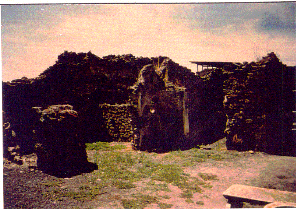
5.44 Casa del Pressorio Terracotta I.4.22, atrium (b): view NW at dining-room (d), left, cubiculum (c), right, fauces (a), far right.