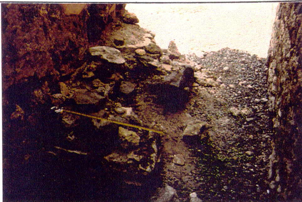
5.38 Caupona di Coposius I.4.11: detailed view SW at the low hearth in the narrow room off front room (a). Scale 0.50 m.