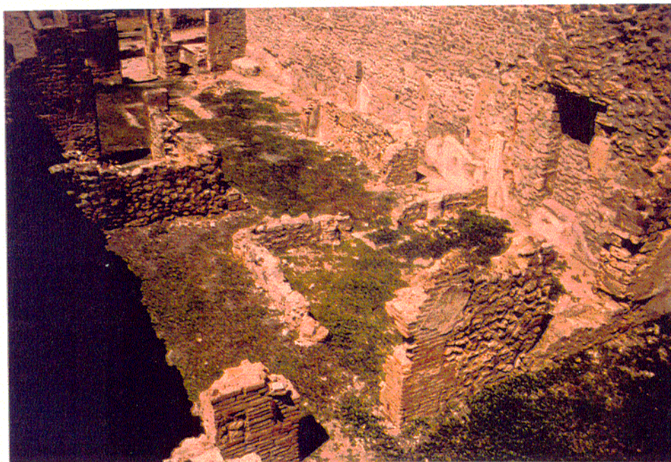
5.25 Casa I.4.1-3: view NW at dining-room (g) right, garden court (f) center, and tablinum (c) and corridor (e) left towards atrium (b).