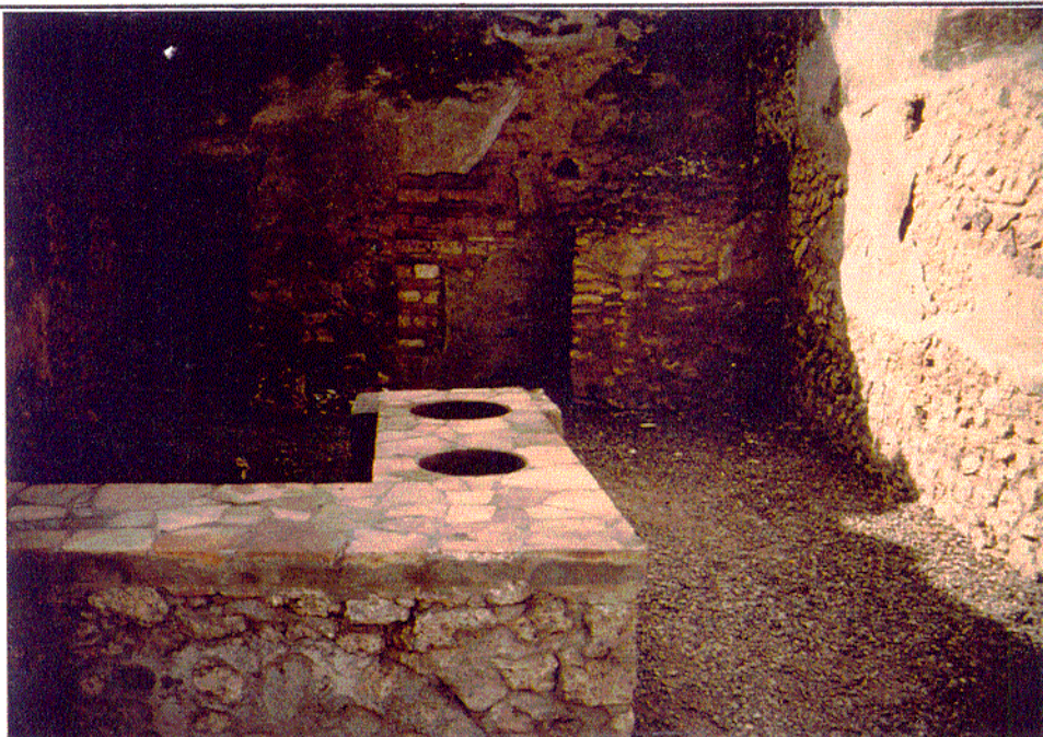
5.46 Popina I.4.27: view S at counter, door to back room (b), left, and latrine partition (a), right.