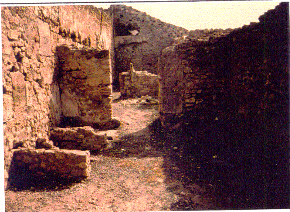
5.34 Fullonica di Passaratus e Maenianus I.4.7: general view E into the building; low walls for work-basins at left.