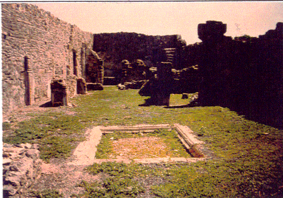
5.24 Casa I.4.1-3: view E through atrium (b), with hearth at left, garden court (f) and dining-room (g) in the far back.