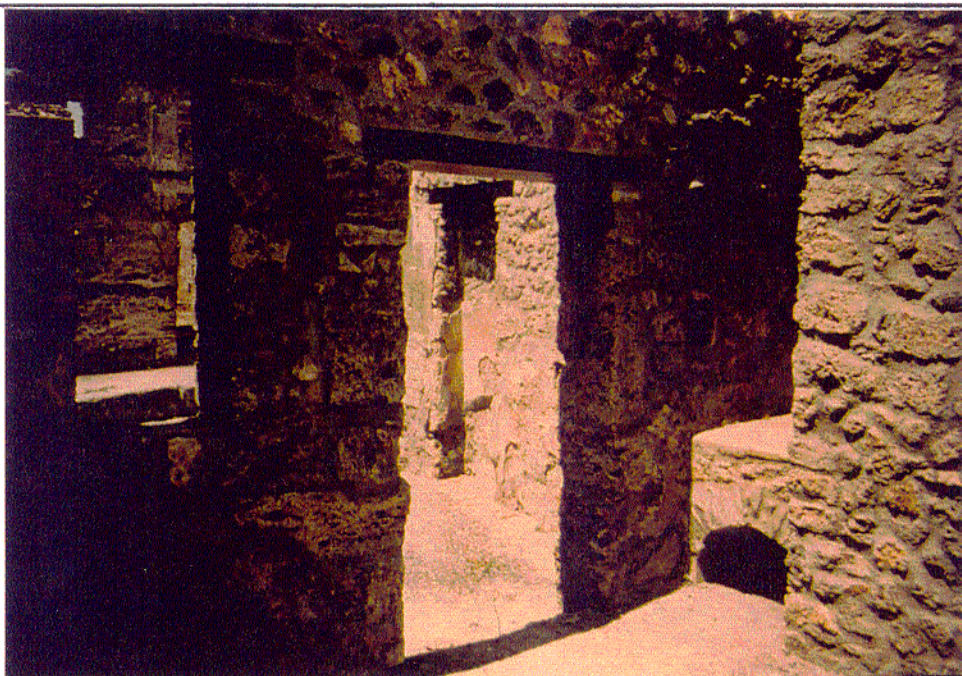
5.26 Taberna I.4.4: view NW at stove in back room (b) and through window and door to front room (a).