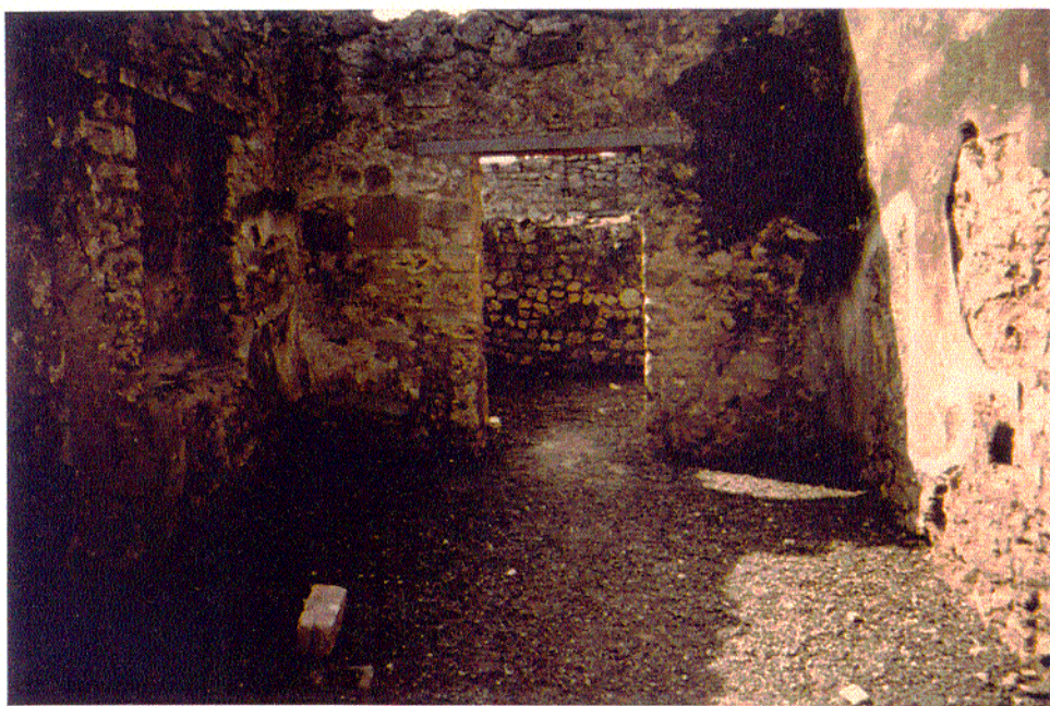
5.41 Taberna I.4.19: view S at two-room (work)shop. Stairs were located in the back left corner.