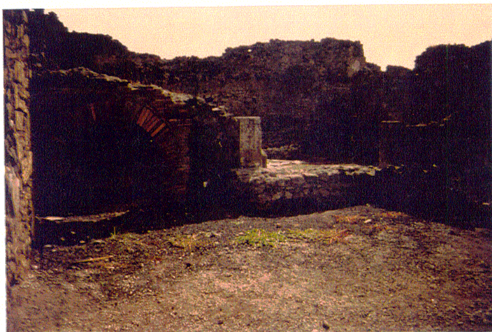
5.39 Bakery I.4.12-14+17: view E at entrance #13A at small oven, and work area (b) in back with large oven, back right.