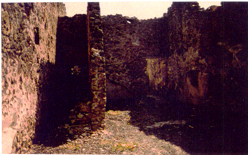
5.37 Caupona di Coposius I.4.11: view E in front room (a), with hearth in narrow room at left, and dining-area (b) right.