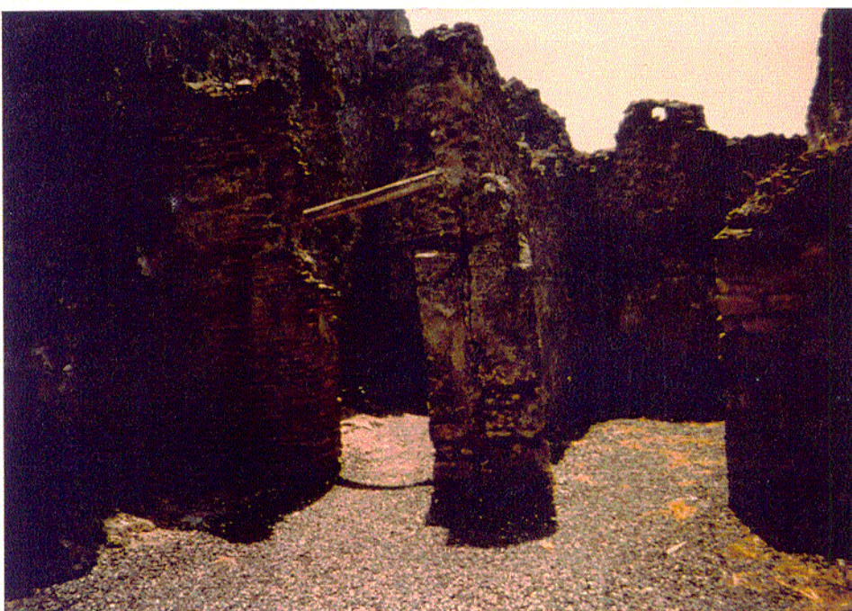
5.47 Officina Faber Ferrarius I.6.1: general view S; main room (1) with remains of basins on left and once a hearth in the center of the room. Cubiculum (2) with bed niche back right; back room (3) with bench along E wall and latrine on S end, back left.