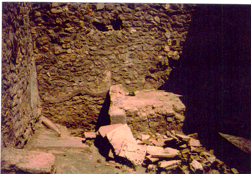
5.27 Casa del Citarista I.4.5-6+25+28, kitchen (42): view N at latrine left, stove right.