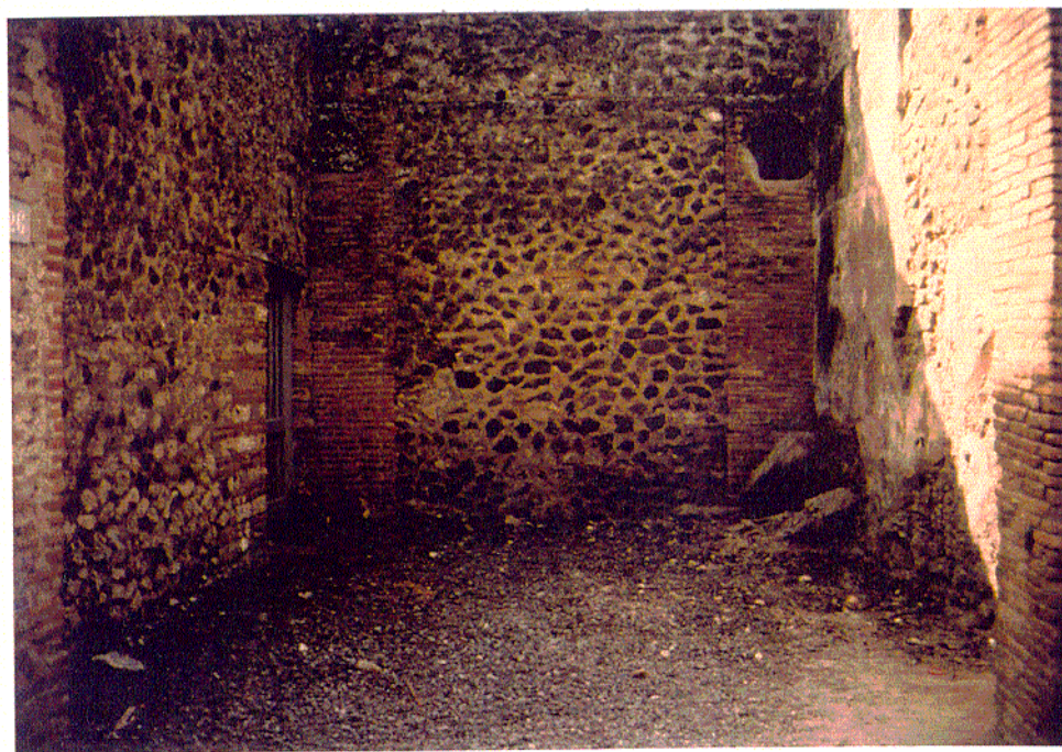
5.45 Fullonica di Dionysios I.4.26: view S, door to back room (a) left, remnants of "furnace" back center, washing basin back right.