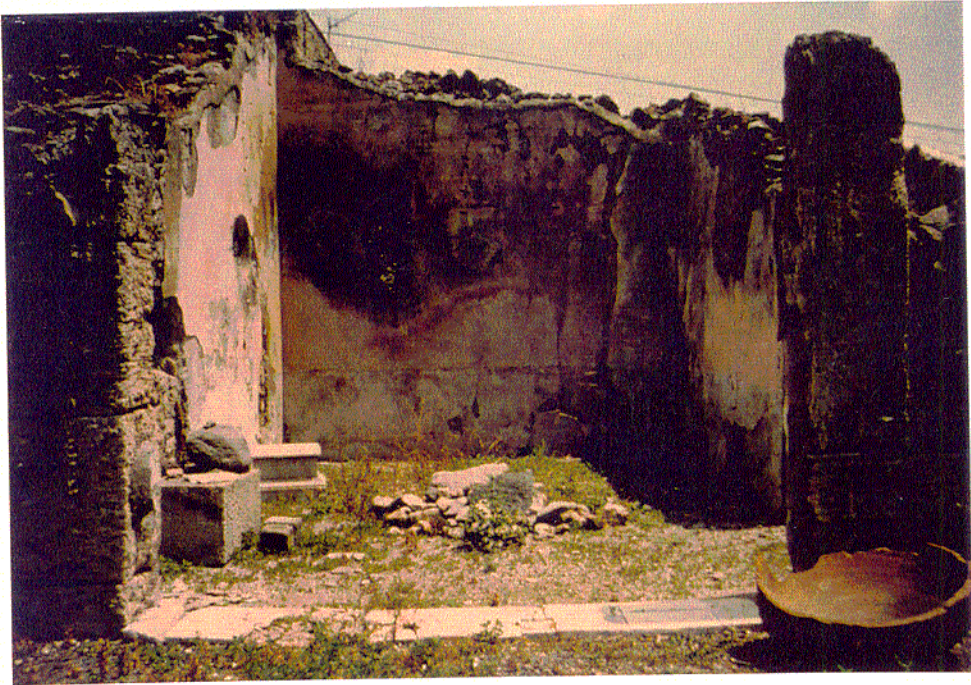
5.33 Casa del Citarista I.4.5-6+25+28, dining-room (58): view E into room from peristyle (56).