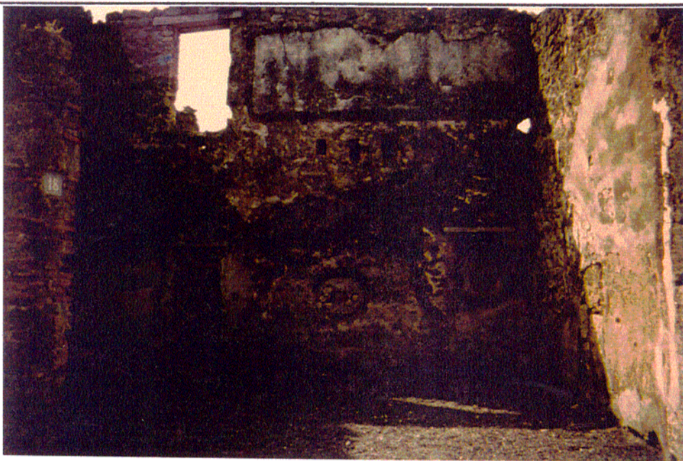
5.40 Taberna I.4.18: view S, door to back room (b) left, and evidence for upper floor.