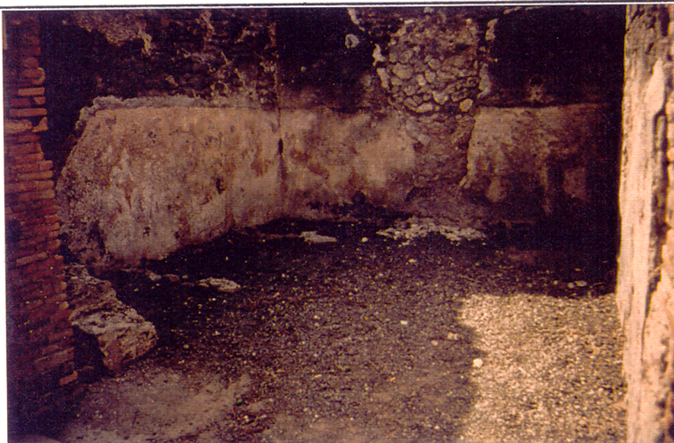
5.42 Taberna and upstairs apartment I.4.20-21: view SE at location of storage urns buried in the ground under the stairs against the left wall.