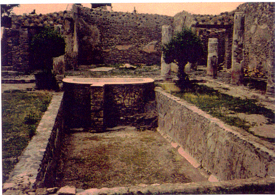
5.31 Casa del Citarista I.4.5-6+25+28, peristyle (17): view W at dining-hall (18) at opposite end of central pool.