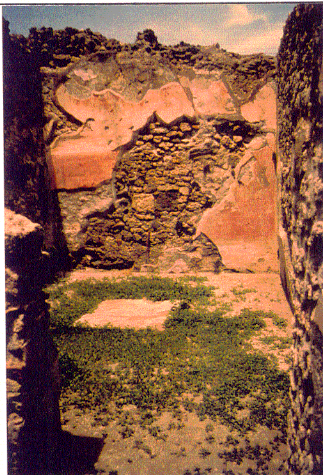
5.36 Casa I.4.9, dining-hall (m): view N, with central opus sectile emblema.