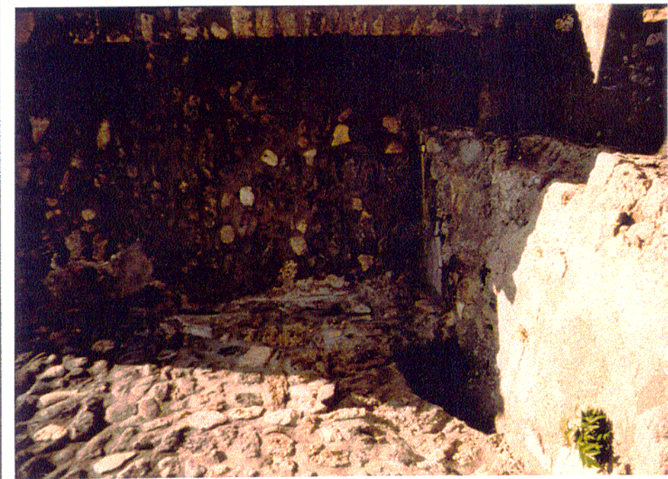
5.28 Casa del Citarista I.4.5-6+25+28, kitchen (42): view E at stove with basin and drain below right, and arched niche above right. Scale 0.50 m.