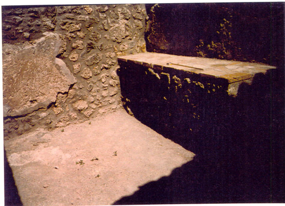
5.43 Casa del Pressorio Terracotta I.4.22, kitchen (h): view SE at stove, right, and raised masonry podium, left. Scale 0.50 m.