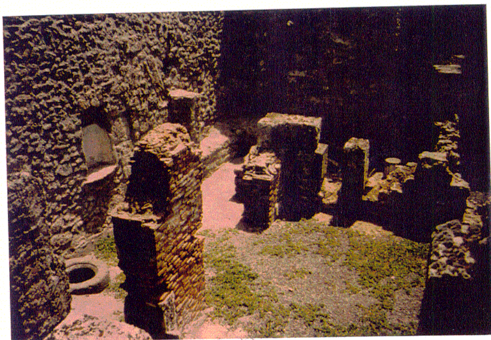
5.35 Casa I.4.9: view SE from the stairs over the tablinum (h) to kitchen (o) with I-shaped stove (center left) and latrine (center right). Small court (n) left, with cistern head and niched shrine.