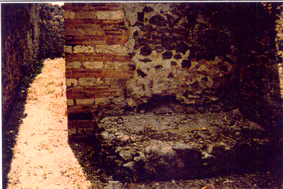
5.30 Casa del Citarista I.4.5-6+25+28, kitchen (64): view S at hearth right and passage left to storage area. Scale 0.50 m.